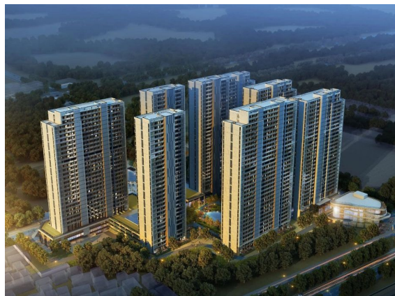
DAAN MOGOT CITY