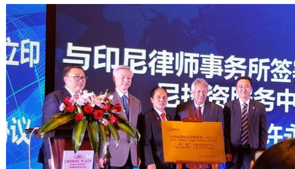
Happy SP Sihombing & Associates