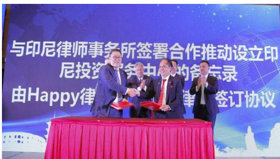
MoU between TOPWE Law Firm, Happy SP Sihombing Law Firm and Mega Global Investment